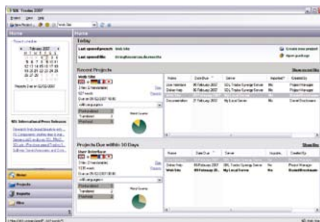
Easily track if projects are early, on-time or late

As a result, the same sentence never needs to be translated again and you can re-use what you have translated as often as you want. Integration with the new SDL MultiTerm 2007 provides powerful terminology lookup and search functions to ensure adherence to corporate terminology and dramatically reduce translation time.